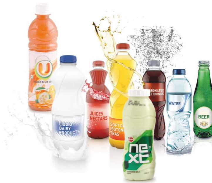
Light weighted & user friendly PET bottles

All milk sold in retail outlets has to be heat-treated to eliminate microorganisms and so extend its shelf life. Based on the type and duration of this heat treatment and the resulting shelf life, milk can be split into three groups. Each heat treatment requires its own packaging. Each milk type has its specific packaging requirements. The shelf life of pasteurised milk being intrinsically very limited, this type of milk requires no particular protection from the effects of light, moreover as its always stored in the refrigerator.